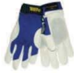
1485 TRUEFIT GRAIN PIGSKIN, THINSULATE LINING