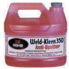
WELD-KLEEN 350 1 GALLON—$19 5 GALLON—$85