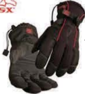
BW50 PIGSKIN PALM MULTIBLEND INSULATION WATERPROOF LINER ADJUSTABLE STORM CUFF SNUG SPANDEX/ NEOPRENE