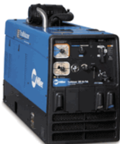
TRAILBLAZER 302 AIRPAK 13,000 WATTS PEAK POWER KOHLER CH750 GAS ENGINE BUILT-IN 26 CFM COMPRESSOR BUILT-IN BATTERY CHARGING # 907549001 $9999