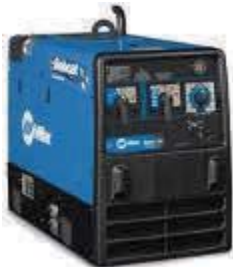
BOBCAT 250 11,000 WATTS PEAK POWER KOHLER CH23 GAS ENGINE 250 AMP AC/275 AMP DC WELDS TRI-COR TECHNOLOGY # 907500001 $3699