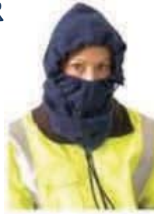
WARM POLAR FLEECE # 1070-01 $16.95