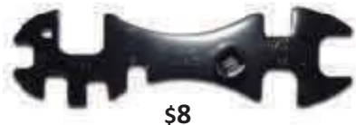
1013C 10-WAY TANK WRENCH $8