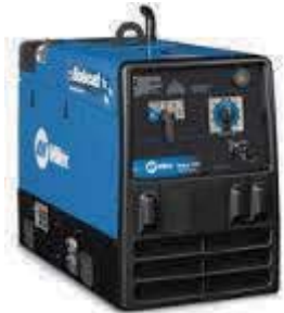
BOBCAT 225 11,000 WATTS PEAK POWER KOHLER CH23 GAS ENGINE 225 AMP AC/210 AMP DC WELDS # 907498001 $3399