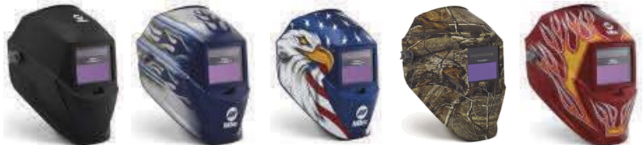
BLACK 256166 BLUE HEAT 256170 AMER. EAGLE 256167 CAMOFLAGE 256169 RED FLAME 256168