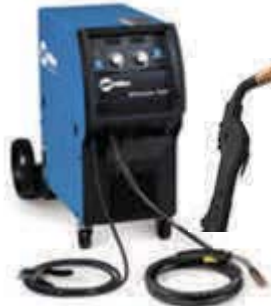
MILLERMATIC 350/350P WELDS UP TO 1/2" STEEL, 1/2" ALUMINUM WITH ALUMA-PRO SYSTEM # 907300 $3999 PACKAGE W/ XR ALUMA PRO #907379 $5799