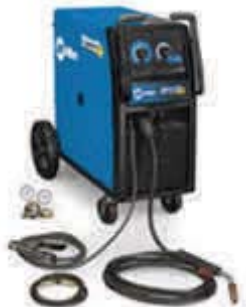
MILLERMATIC 212 W/ AUTOSET WELDS UP TO 3/8" STEEL, 3/8" ALUMINUM WITH OPTIONAL SPOOLMATE 200 # 907405 $1679 PACKAGE W/SPOOLMATE 200 # 951177 $2499