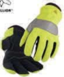
15HV HI-VIZ WATERPROOF WINTER LINING