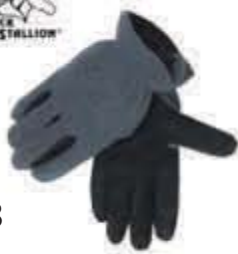
15FH-GRAY POLAR FLEECE, COWHIDE PALM