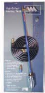
WM300801 HEAVY DUTY HIGH OUTPUT PROPANE TORCH $75

ACETYLENE "SCREW-IN" FEATHER FLAME) #WM300101 $129 (ACETYLENE "SNAP-IN" TURBO FLAME) #WM300205 $175 (PROPANE/LP "SNAP-IN" TURBO FLAME) #WM300304 $180