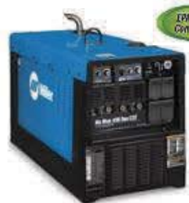
BIG BLUE 400 ECO PRO 5500 WATTS PEAK POWER DESIGNED TO BE 25% MORE FUEL EFFICIENT DURING WELDING OPERATIONS MITSUBISHI S4L2 4-CYL ENGINE 44% SMALLER, 41% LIGHTER THAN COMPETING MODELS # 907426 $11,899