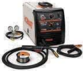
HANDLER 140 WELD 24 GAUGE TO 3/16" 120V #500500 $515