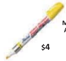
MARKAL VALVE ACTION PAINT MARKER #968XX $4