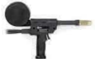
SPOOLMATIC 30A EASILY CONNECTS TO MILLERMATIC 212, 252, 350 FOR ALUMINUM WELDING # 130831 $999