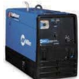
TRAILBLAZER 275 DC 11,000 WATTS PEAK POWER KOHLER CH23 GAS ENGINE 275 AMP DC ONLY WELDER # 907214 $4149