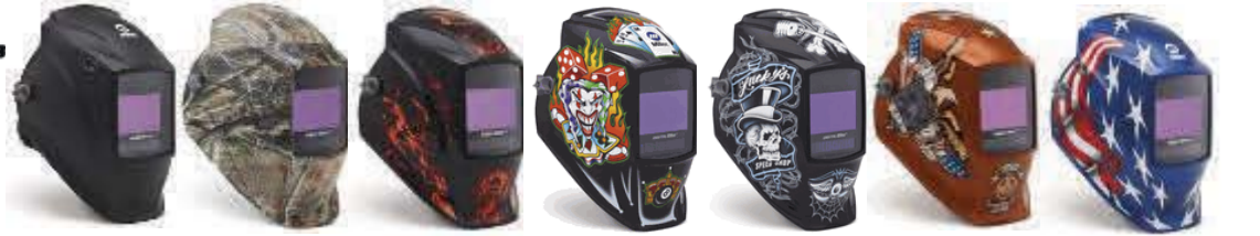
BLACK 257213 CAMOFLAGE 256173 INFERNO 257217 JOKER 257218 LUCKY'S 257214 VINTAGE USA 257215 STARS & STRIPES 257216