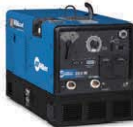
WILDCAT 200 6500 WATTS PEAK POWER SUBARU EX40 GAS ENGINE 200 AMP DC WELDER # 907546001 $2825