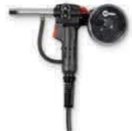
SPOOLMATE 100 EASILY CONNECTS TO MILLERMATIC 140, 180, 211, AND PASSPORT PLUS FOR ALUMINUM WELDING # 300371 $225