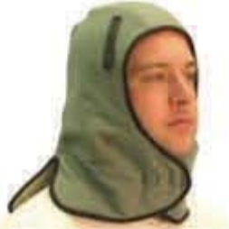
SOFT SHEEP THERMAL LINER # 700 $12.95