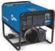
BLUESTAR 145DX 4500 WATTS PEAK POWER KOHLER CS10 GAS ENGINE 145 AMP DC WELDER # 907544001 $2399