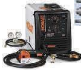
HANDLER 210 MVP WELD 24 GAUGE TO 3/8" 120 OR 230V #500553 $965