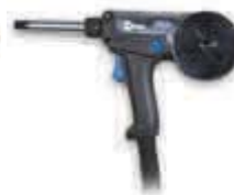
SPOOLMATE 200 EASILY CONNECTS TO MILLERMATIC 211, 212, 252 FOR ALUMINUM WELDING # 300497 $629