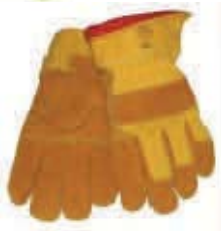
1578 COTTON FOAM LINING COWHIDE PALM