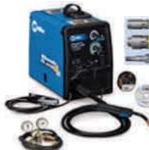
MILLERMATIC 211 W/AUTOSET WELDS UP TO 3/8" STEEL, 3/8" ALUMINUM WITH OPTIONAL SPOOLMATE 100 115/230 DUAL VOLTAGE # 907422 $1049