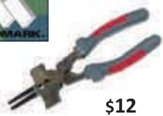
WMPP2210C MIG PLIERS $12