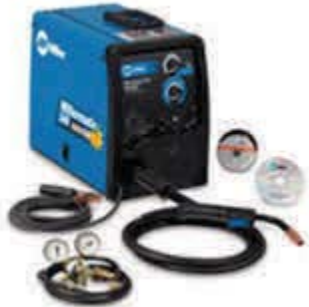
MILLERMATIC 140 W/ AUTOSET WELDS UP TO 3/16" STEEL, 14 GAUGE ALUMINUM WITH OPTIONAL SPOOLMATE 100 # 907335 $689