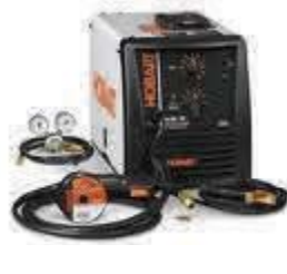
HANDLER 190 WELD 24 GAUGE TO 5/16" 230V #500554 $705