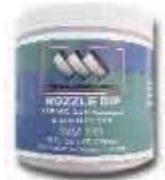
WM731 NOZZLE DIP $6