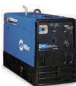
TRAILBLAZER 302 11,000 WATTS PEAK POWER KOHLER CH23 GAS ENGINE 225 AMP AC/300 AMP DC WELDS EXCELLENT MIG/FCAW PERFORMANCE, LIFT ARC TIG # 907216 $4379