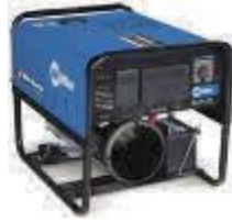
BLUESTAR 185DX 6000 WATTS PEAK POWER KOHLER CS12.75 GAS ENGINE 185 AMP DC WELDER # 907545001 $2649