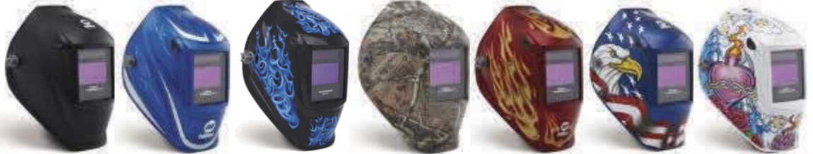
BLACK 256159 64'CUSTOM 256160 BLUE RAGE 256164 CAMOFLAGE 256163 FIREBALL 256162 AMER. EAGLE 256161 FUSION 256165