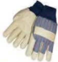
1567 TOP GRAIN PIGSKIN, THINSULATE LINING