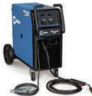
MILLERMATIC 252 WELDS UP TO 1/2" STEEL, 1/2" ALUMINUM WITH OPTIONAL SPOOLMATIC 30A # 907321 $2199 PACKAGE W/ SPOOLMATIC 30A # 951066 $3379