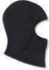
F/R TREATED BALACLAVA # 16821 $7.99