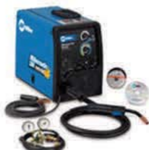
MILLERMATIC 180 W/ AUTOSET WELDS UP TO 5/16" STEEL, 1/4" ALUMINUM WITH OPTIONAL SPOOLMATE 100 # 907312 $859