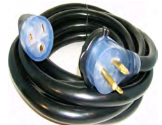
83 Welding Machine Extension Cords, 25 Ft. and 50 Ft.