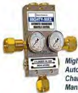
Mighty-Max Automatic Changeover Manifold