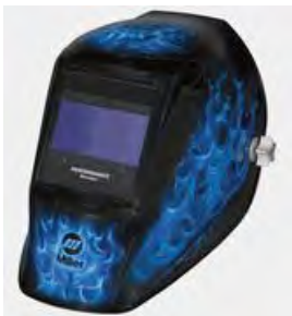
BLUE RAGE # 241458

*** FREE 2 ND DAY AIR SHIPPING DIRECT FROM MILLER ON ALL HELMETS