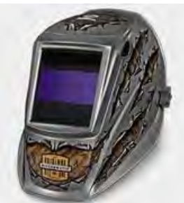
MILLERMATIC II # 232037