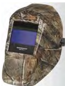
CAMO # 241460