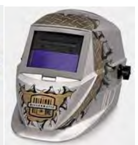
MILLERMATIC # 231406