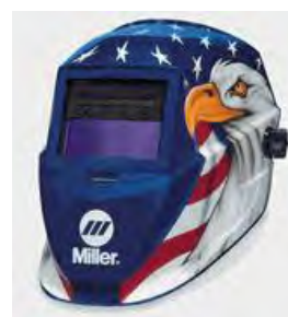
AMERICAN EAGLE II # 231405